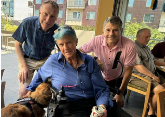
North Park Seniors residents enjoying a Lunch and Learn event.

Over the summer, the County of San Diego offered our Windsor Gardens older adult community free weekly, instructor-based, Tai-Chi stretching classes. Residents commented that they felt overall improvement in their range of motion, feeling less tense, and enjoyed the overall calmness of the classes offered.