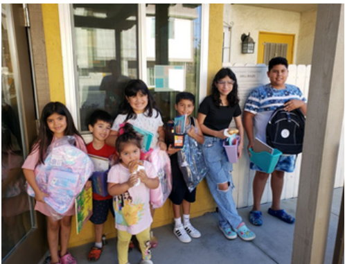
Students at Mayberry Townhomes receiving school supplies.

Back-to-School Family Nights were hosted at five communities across San Diego and Los Angeles. Families came together with their neighbors and youth received donated school supplies, backpacks and books, setting them up for the new school year.